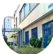
Santana Campus Sao Paulo